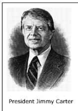
President Jimmy Carter